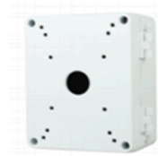
811 Junction Box