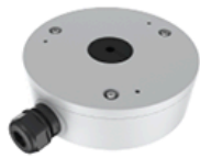
TC-P548BM Spec: V1 Junction Box