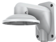
A25 Corner/Pole Mount