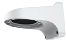
A28 Wall Mount