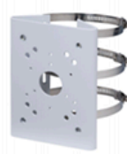
A36 Pole Mount