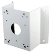
A35 Corner Mount